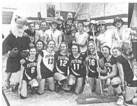
The senior girls swept the floor after their victory at SOSSA.

The Flyers definitely met their goal this year of making it to OFSAA and taking home a medal as they were awarded bronze in this year's OFSAA AA championships in Kenora.