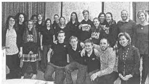
The EPEREIA team poses for the camera

EPEREIA has been active in the Eden community for the past several months.