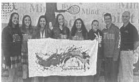
OFSAA swimmers smile for the camera celebrating their victory.