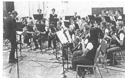
Westgate Mennonite Collegiate Students a part of concert band performing at another high school during their tour.