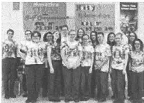
The Eden talks group hopes for students to participate in workshops and to find stress relief through these talks.

Since the 2013-2014 school year, Eden High School has set up a student-led mental health initiative with a purpose of positive