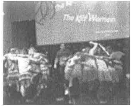
The Kilt Men and Kilt Women prepare for their nursery rhyme group rap battle.